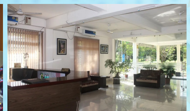
Vishranta - The Guest House (বিশ্রান্ত), DU