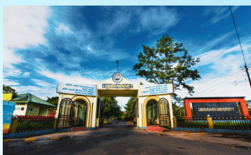
Main entrance of Dibrugarh University

The climate of Dibrugarh is very pleasant during the month of December when the temperature varies within 13°C - 17°C. The participants are advised to bring necessary clothings suitable for the climate.