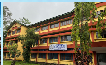
Department of Statistics, Dibrugarh University