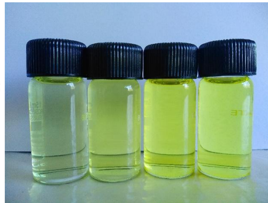
Synthesized MoO 3 Quantum Dots