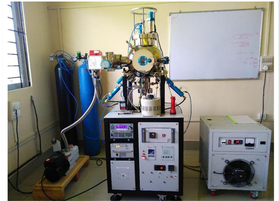
Multipurpose Coating Unit