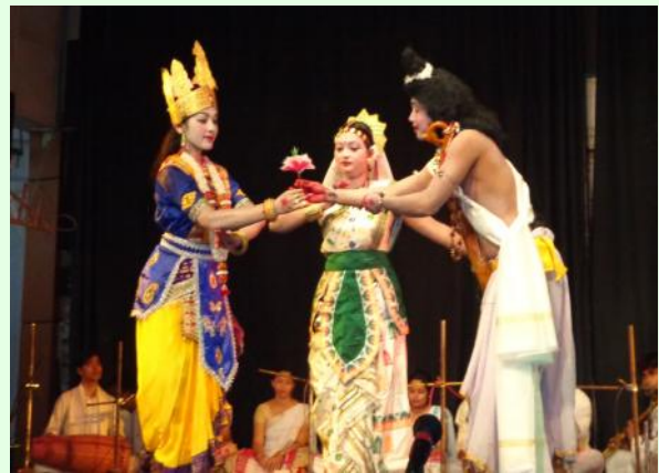
A scene of Parijat Haran Bhaona at Rangghar