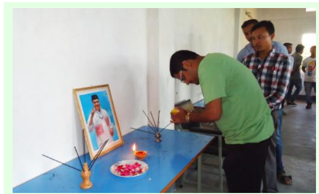
Students paying homage to Late Dr. Bhupen Hazarika