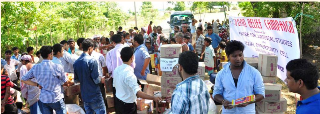
Students volunteers distributing relief materials at Baroghoria ME School, Bogibeel