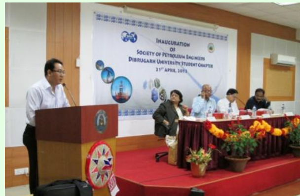
Inaugural function of SPE, Dibrugarh Chapter