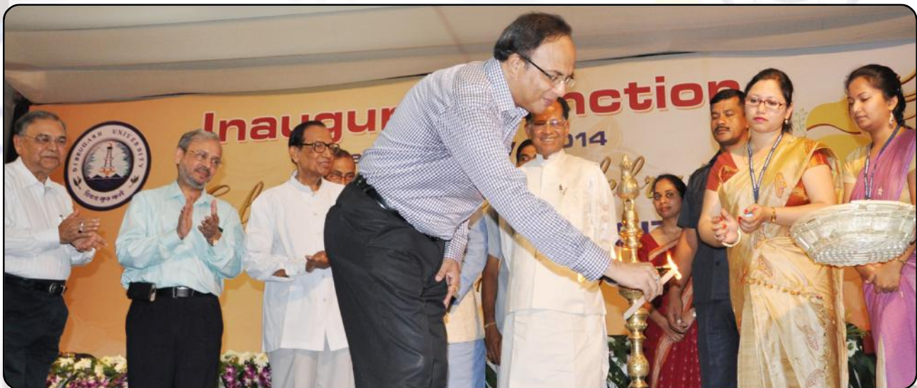
The Vice Chancellor lighting the ceremonial lamp