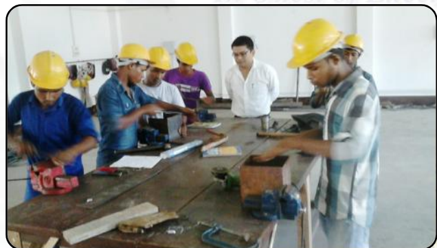
Students from a nearby village attending training programme conducted as part of DU's Associate Village Programme