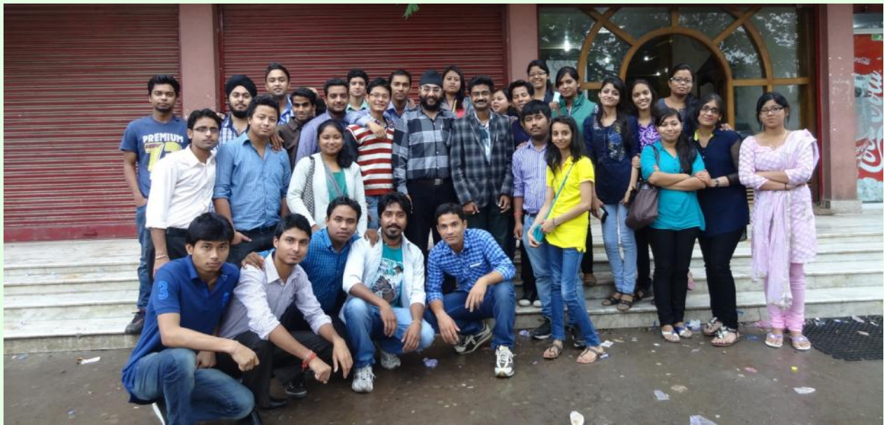
Students and faculty members of the Department of Commerce at NRL

phases. In the first phase, the team was given a tour of the entire refinery by HR and PR executives of the company. In the second phase, a virtual presentation was made by the PR team in the training hall followed by an interaction between the students and their executives about the functioning of the organization.