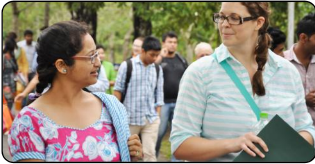
DU students interacting with a group of students from the University of South Florida, USA, with whom DU has initiated an academic collaboration