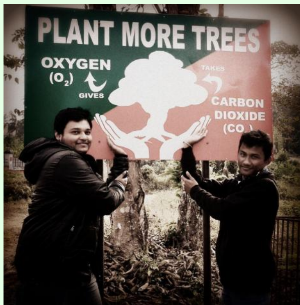
Students of the centre pledging to do their bit to conserve the environment on World Environment Day

the Centre on 4 October 2013 with a motto to restore the deteriorating environment by protecting, restoring and promoting awareness about the environment has completed another project, that is cleaning the University campus on 13 September 2014.