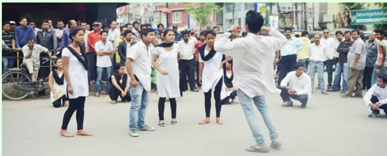
Students of Centre for Studies in Journalism and Mass Communication staging a street play on voter sensitization in H.S. Road, Dibrugarh