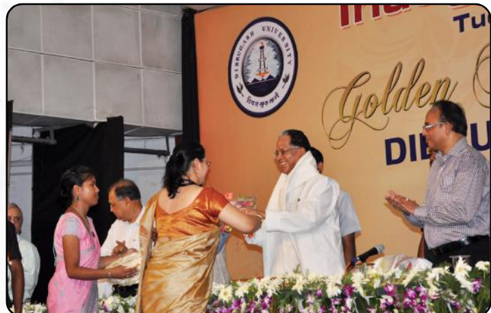
The Chief Minister Sjt. Tarun Gogoi being felicitated