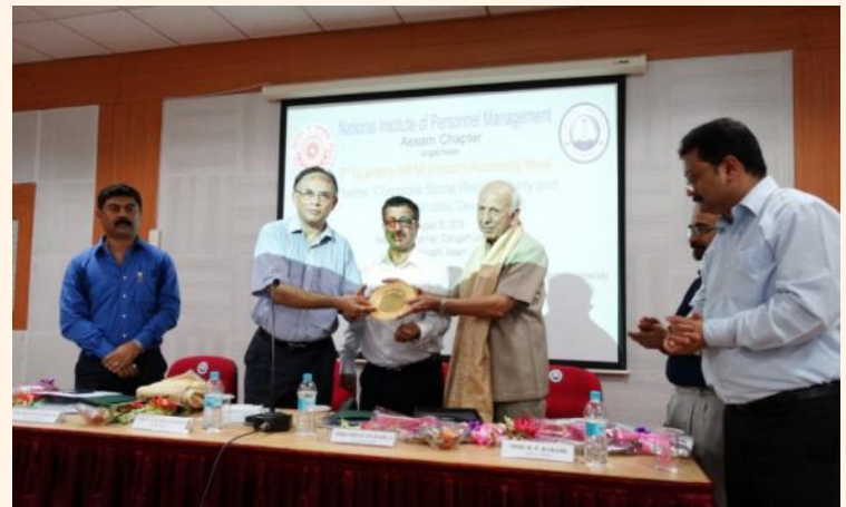
HR and Industry-Academia Meet