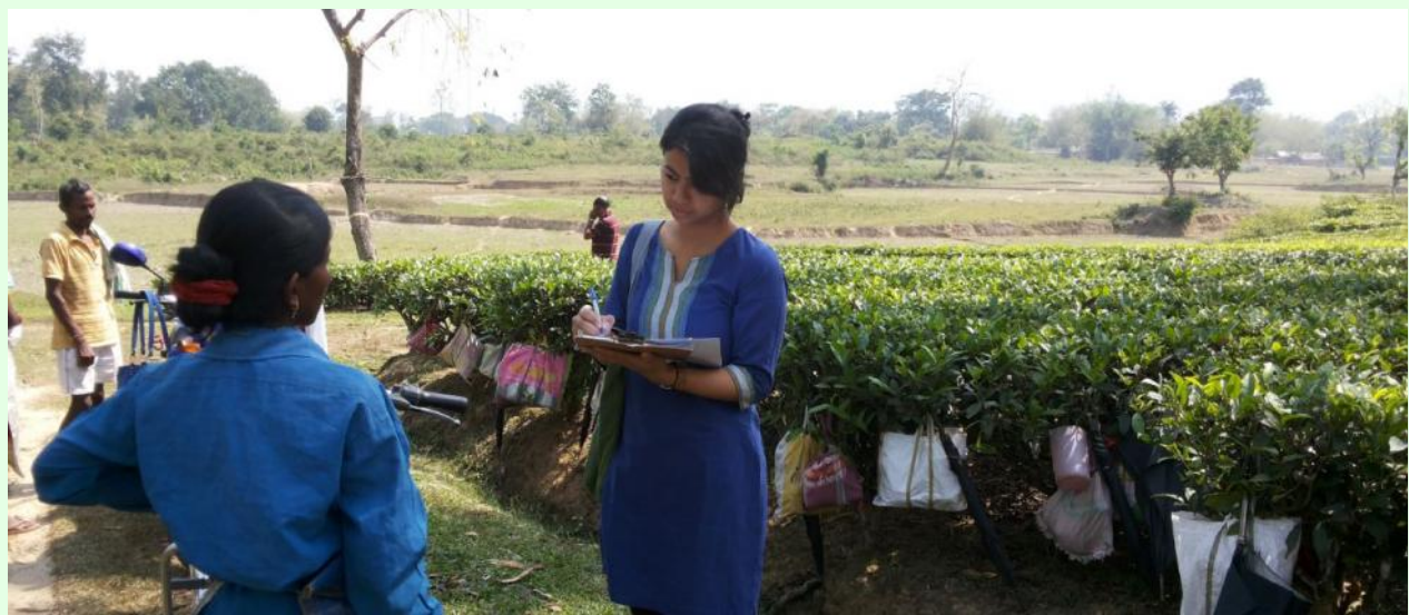
Students of the Centre conducting field research in a tea garden

Dibrugarh University in collaboration with Centre for Social Work Studies signed a MOU with Solidaridad , an NGO based in Netherland, on 9 April, 2014. As per the terms of understanding, the students of the outgoing batch of CSWS, were instructed to carry out research on the various Tea Estates in Assam and West Bengal on the topic Survey of Tea Garden Workers Welfare in Assam and West Bengal from April 17-25, 2014. After the survey, the Centre provided the organisation with all necessary requisites. It is worth mentioning that Solidaridad is functioning at par with the Corporate Social Responsibilities as entitled to them by TATA.