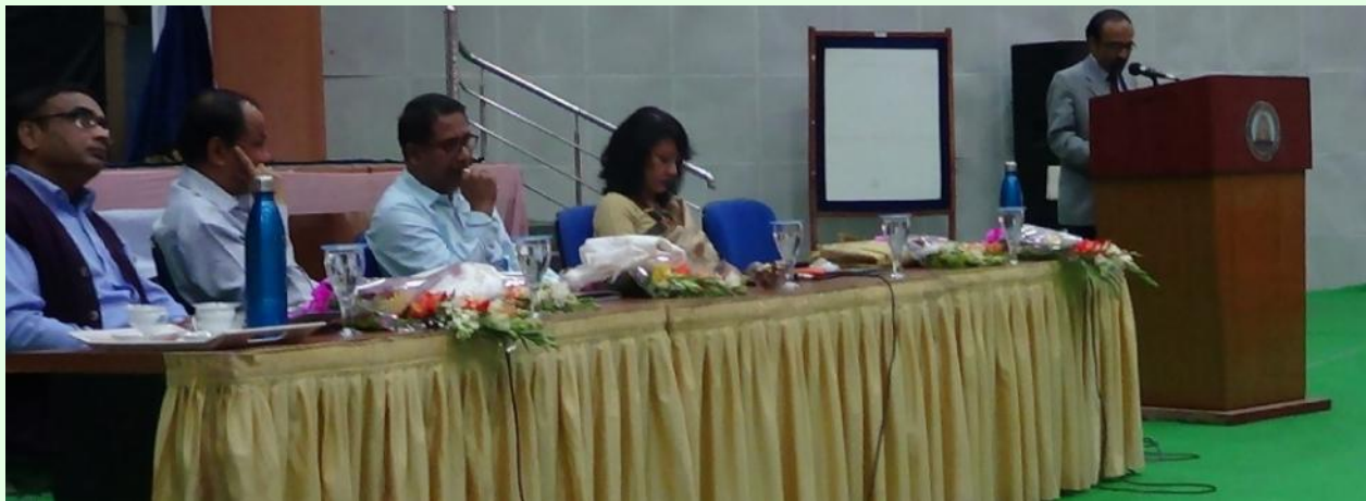
A glimpse of the session