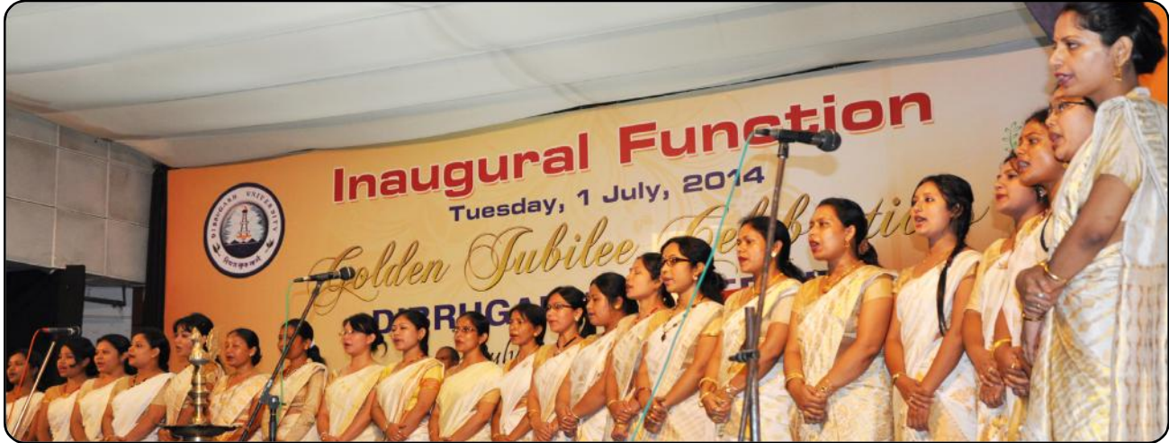
Students singing the Inaugural Chorus