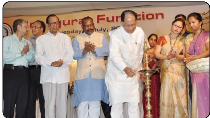
The Chief Minister of Assam, Sjt. Tarun Gogoi lighting the ceremonial lamp