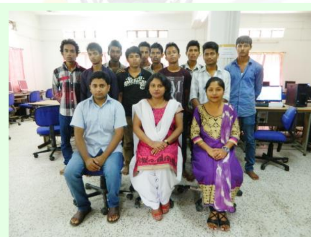
Students from a nearby village participating in the Short term computer training under Associate Village Programme