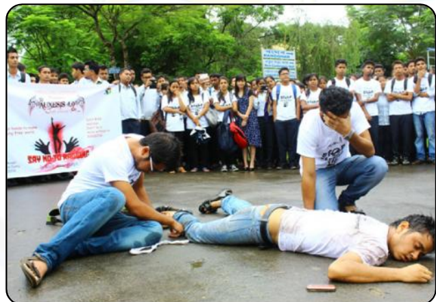
Street-play enacted to sensitise the students about the menace of ragging