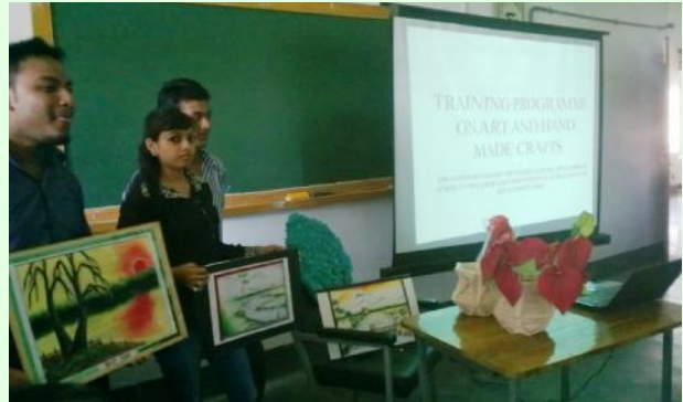
Participants at the training programme on art and handmade crafts