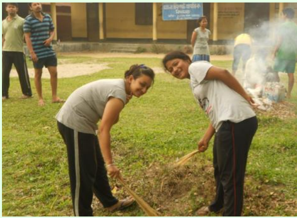
Hygiene and Sanitation awareness drive at the Rural Camp