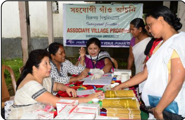
Health Camp in Puhari Khonia Village, Dibrugarh, as part of Associate Village Programme in 17 August 2014