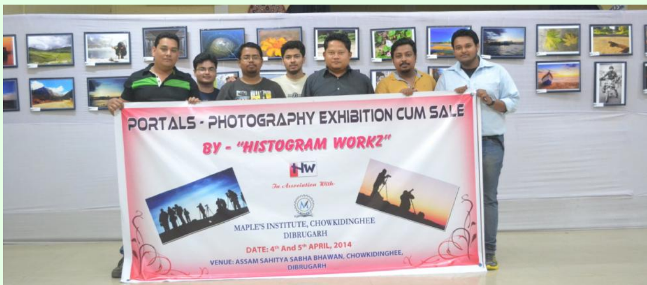
Students of the centre participating in the photography exhibition - Portals

University campus to spread the message for a clean and green environment.