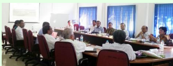
Meeting of the DST Programme Advisory Committee